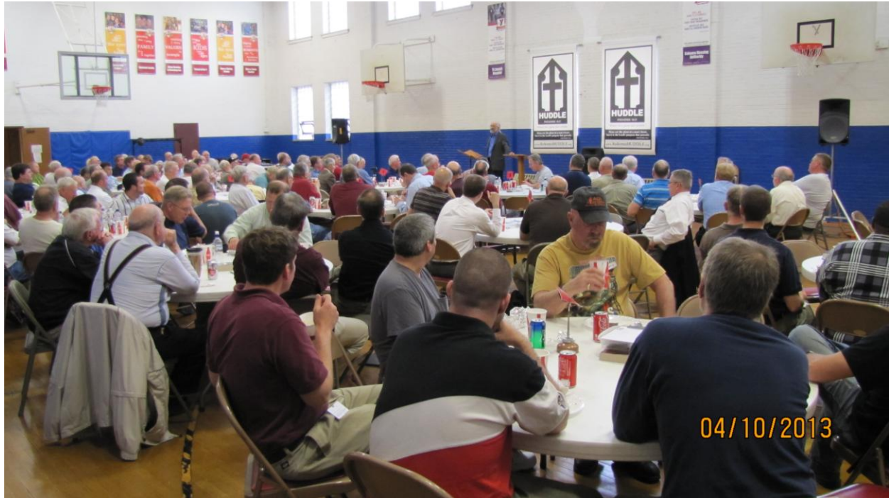
Men's Huddle at Kokomo YMCA