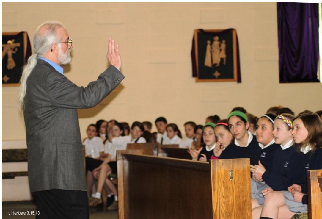
Answering questions at the Church of the Resurrection