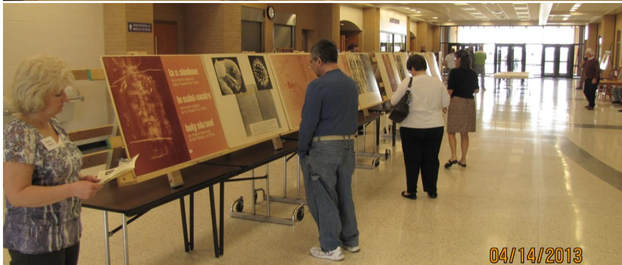
Shroud exhibits in the lobby of the auditorium at Northwestern High School