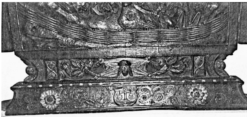
ONE OF THE MANY ARTEFACTS IN SWITZERLAND SHOWING THE FACE OF CHRIST ON A CLOTH. EVIDENCE OF COPYING FROM MANDYLION OR SHROUD