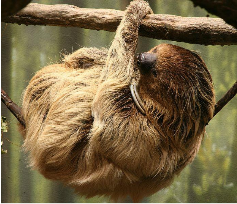
A two-toed sloth

The toes of Sloths and Bats seem far removed from a Divine miracle, but the principle could be used as an analogy to explain how a post-mortem Jesus could achieve the seemingly impossible feat of creating a photograph of Himself whilst converting into pure 'Light' energy. Sloths and Bats each have unique mechanisms for achieving something that seems impossible for other animals to achieve, i.e. hanging upside down against gravity while asleep, and maybe Jesus also had qualities that were similarly contrary to human expectations. Maybe the Resurrection took less 'conscious' effort than our understanding of neutron radiation would lead us to conclude? It's easy to assume that because he looked like a man, that he shared the same experience as the rest of humanity, but maybe his understanding of natural forces was so far beyond ours, that he was no-longer bound by the natural laws that we perceive to be immutable.