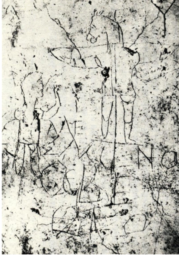
Blasphemous Crucifix of the Palatine.