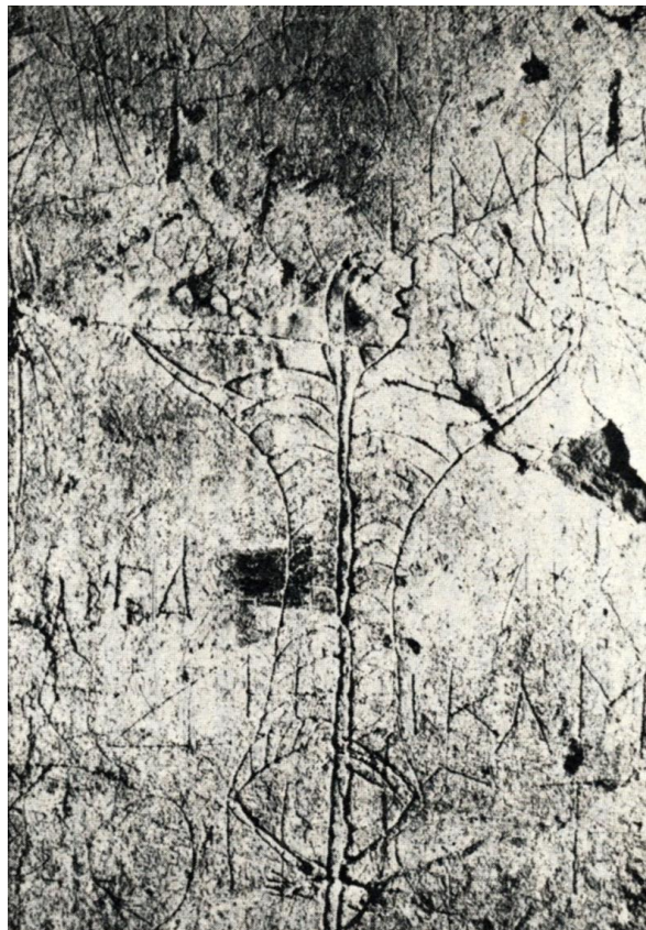
The graffito of Pozzuoli.